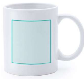
POCKET CENTERED Sublimation Q (95mm x 70mm)