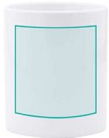
UPPER FRONT Sublimation Q (95mm x 70mm)