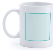
POCKET CENTERED Sublimation Q (95mm x 70mm)