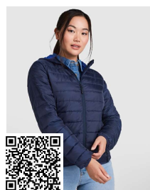
NORWAY WOMAN RA5091