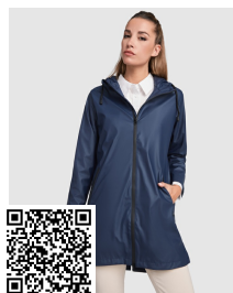
SITKA WOMAN CB5202